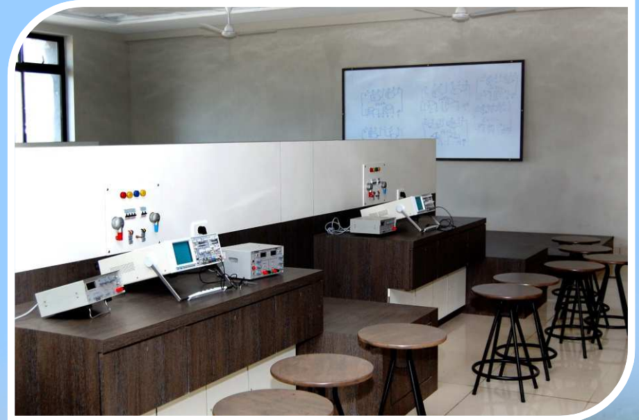
Basic Electrical Lab