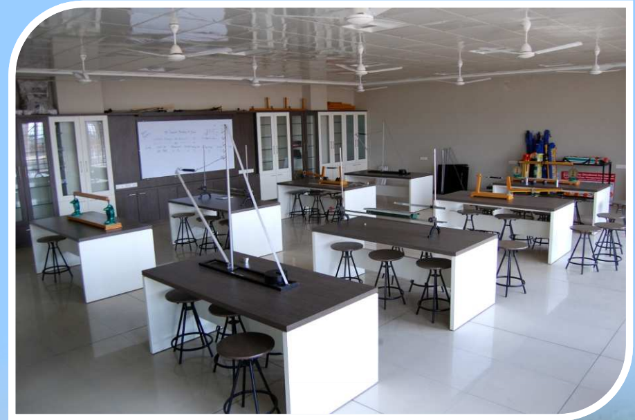
Basic Civil Lab