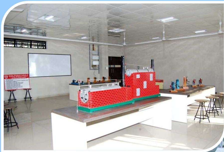
Basic Mechanical Lab